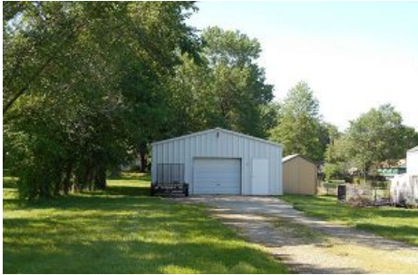
Pin 16-09-31-104-000-045.000 Photo